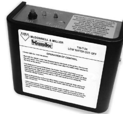
Electrical Control Unit (for remote mounting)