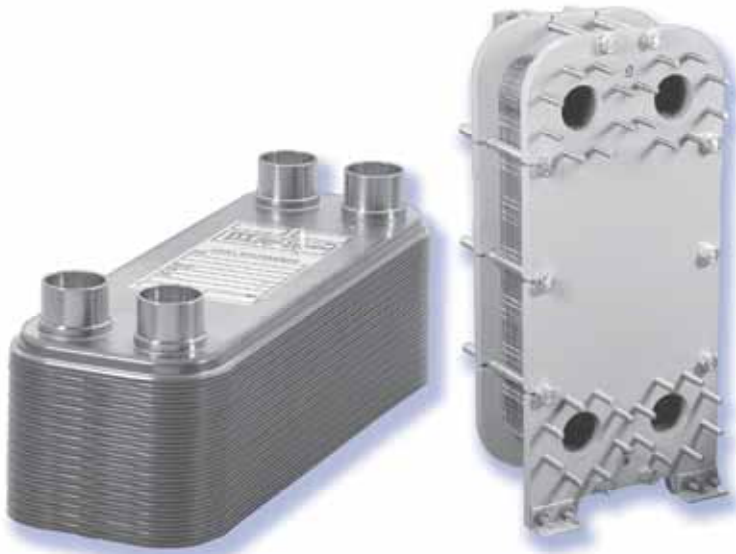
PLATE OR BRAZED