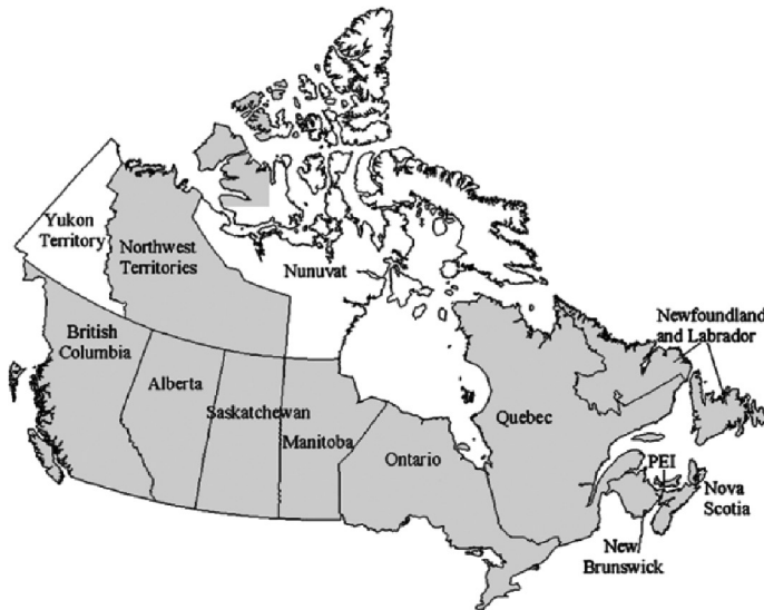
Provincial/Territorial Adoption of ANSI/NSF Standard 61